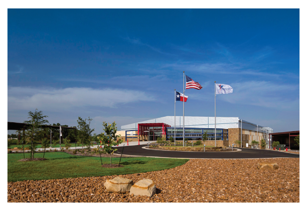
Round Rock Sports Center