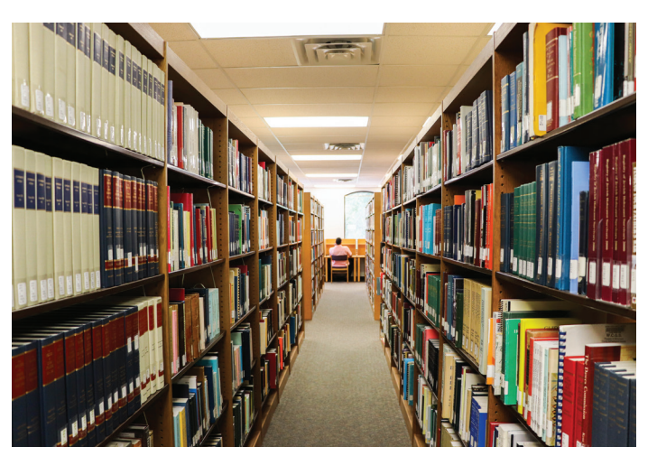
Book stacks at Round Rock Public Library