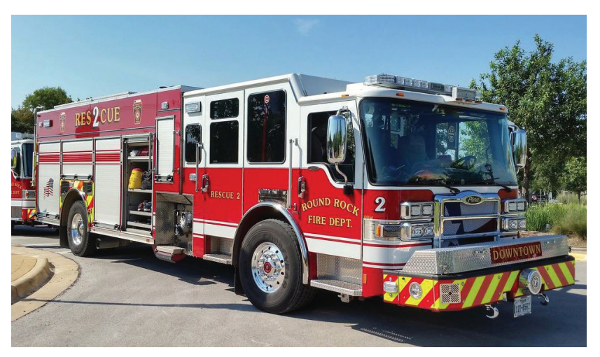
Round Rock Fire Department truck

To accommodate expected growth in the next decade, land use policies will be significant factors in considering facility placement. Future facilities in the Northwestern and Northeastern regions of the city are being considered. In the next decade, RRFD plans to coordinate the purchase of land for future facilities in high-growth areas. RRFD also plans to expand the Community Risk Reduction Program, which connects the Department with members of the community to provide risk assessments of their home environment.