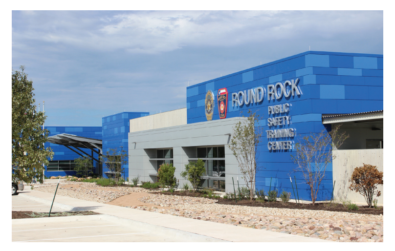
Round Rock Public Safety Training Center

Land use decisions also have implications for RRPD's service delivery. As new schools are constructed, RRPD works with the school district to ensure efficient traffic flow during peak times. Additionally, large developments, such as Kalahari Resorts, prompt RRPD to evaluate impacts on the demand for police services. The overall goal is to ensure that RRPD keeps pace with changing service demand in the coming decade.