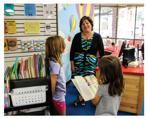
Children talking to Library staff

As the city's population continues to grow, construction of additional branch libraries may be considered to meet Round Rock's changing needs. At the projected build-out population, RRPL desires branch libraries in the Northeast and in the West, as well as one bookmobile.