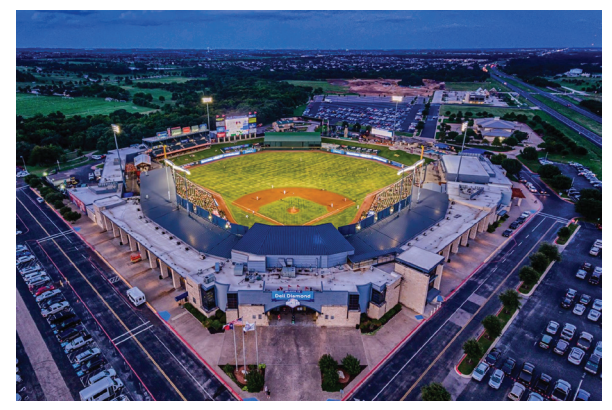
Dell Diamond at night

To become a true industry leader, the planning, design, and expansion of two facilities in the next decade is desired, including expansion of the Multipurpose Complex, and an addition to the Sports Center. Increasing the number of regional and national sports tournaments and expanding sports facilities will help to increase city revenues that will benefit residents and the local economy throughout the next decade.