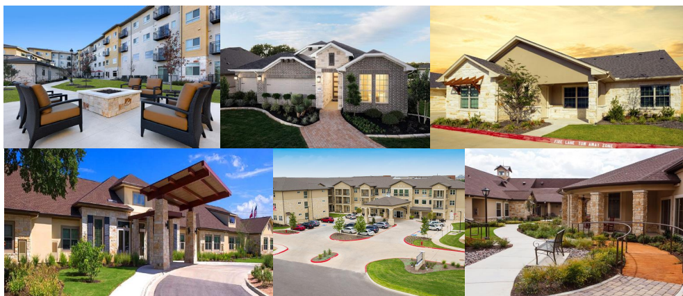
Images, clockwise, from upper left: Affinity at Round Rock, Heritage at Vizcaya, Emerald Cottages at Round Rock, Bel Air at Teravista, The Enclave at Round Rock, Poet's Walk

While not all older adults desire to live in senior housing, Round Rock aims to provide senior housing for all those who seek it. On average, 12% of Americans 50 and older wish to age somewhere other than their current home (Robinson-Lane, 2022). Assuming similar demand exists for the residents of Greater Round Rock 55 and older, Greater Round Rock may not meet current demand for age-restricted living. On average, 2% of Americans 65 and older live in assisted living. If similar demand exists in Greater Round Rock, Greater Round Rock provides an adequate amount of assisted living. Greater Round Rock's nursing facility capacity is less than the average American demand for this type of senior care, where 4.5% of Americans 65 and older reside in a nursing home. This may indicate that demand for nursing homes is not as high in the Greater Round Rock area or that nursing home capacity does not meet current demand. Round Rock may wish to do further research to determine its need for additional senior housing of all types. Additionally, the needs of older adults extend beyond housing. To ensure that Greater Round Rock remains a place where people want to retire, the city should continue to support services such as healthcare, transportation, and programming.